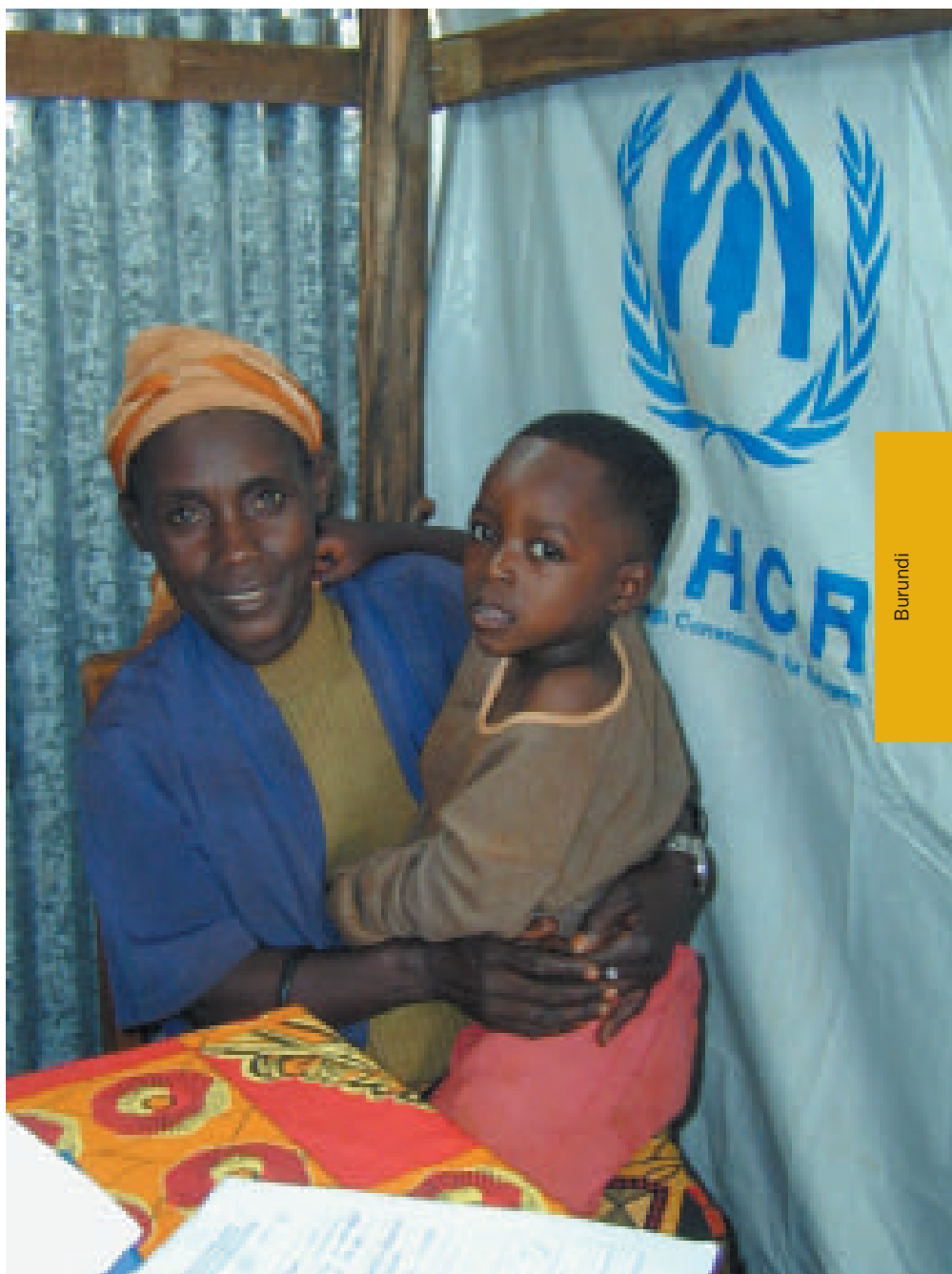
A returnee mother and her child, just returned from Tanzania, awaiting registration at Gisuru reception centre.

UNHCR will provide basic assistance to DRC refugees in established camps in Gasorwe and Gihinga and will support a health clinic and school facilities for refugees in Bujumbura town. Together with its partners, the Office is regularly updating contingency plans for a sudden arrival of DRC and