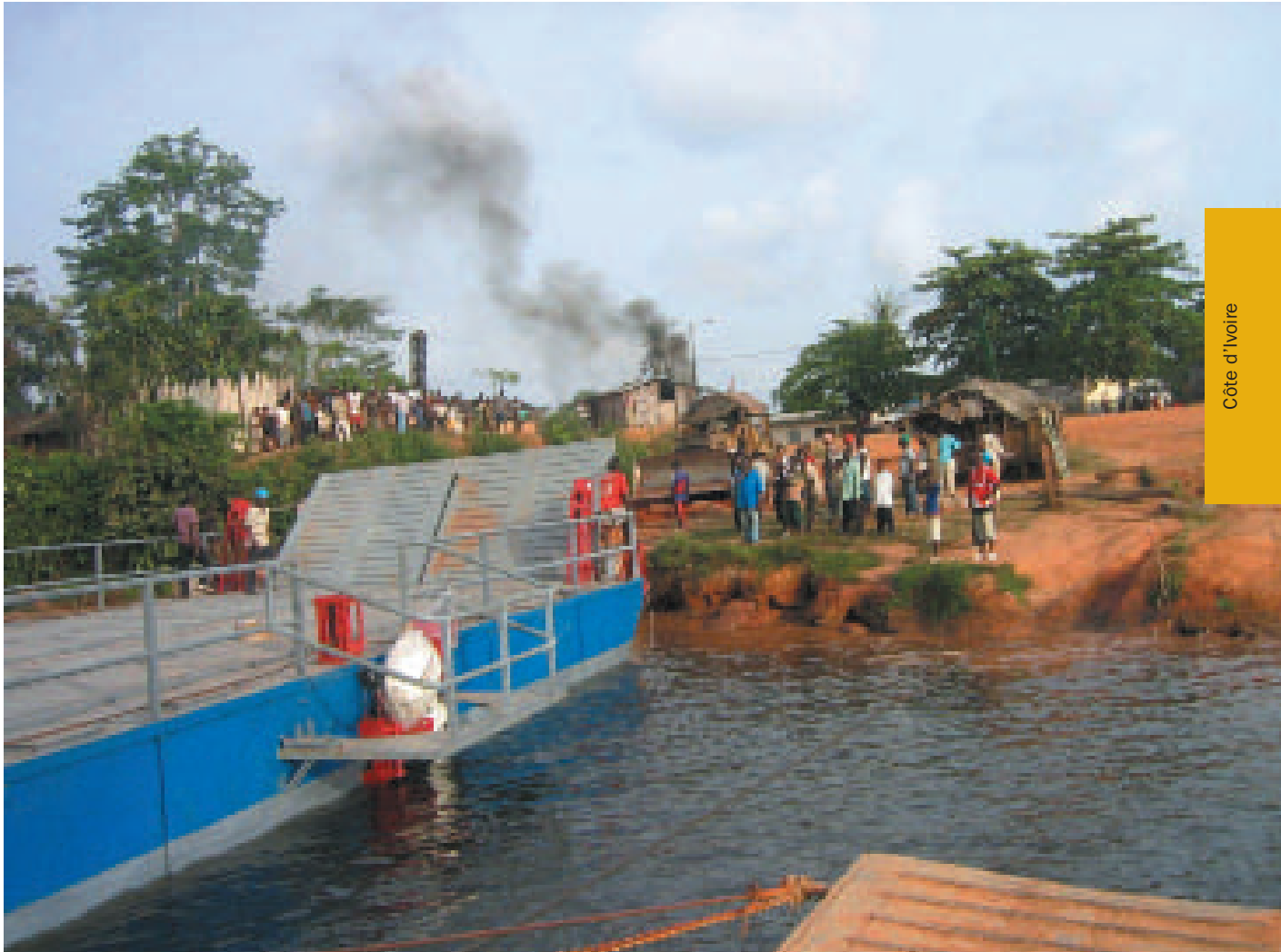
The UNHCR ferry in Prolo used for repatriation from Tabou to Liberia, seconds after it was put on the waters as residents, some Liberian refugees and the technical team look on.

west of the country, and some 4,000 live in Abidjan. The majority of those in the ZAR live in villages, and the rest live in two camps, in Tabou and Nicla. UNHCR will promote voluntary repatriation in line with the regional multi-year plan and facilitate the local integration of those who choose to stay in Côte d'Ivoire, thereby reducing their dependence on assistance. Urban-based Liberian refugees will be assisted only with health care and primary education. They will be encouraged to return to Liberia, but if they remain they will be assisted to integrate in the ZAR villages (the policy of the Ivorian Government being to provide assistance in the ZAR only). UNHCR will continue its mass information campaign to inform refugees on the situation in Liberia and thus help them make an informed decision on whether or not to return.