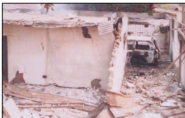
Le bureau de terrain du HCR à Guiglo après les événements du 18 janvier 2006.

L'évacuation du personnel de l'UNHCR à Abidjan suite à la destruction de son bureau l'a amené à adapter sa stratégie de mise en œuvre de ses activités au camp de Nicla. Désormais, les activités sont limitées à la protection, à l'aide de subsistance (santé et nourriture) et l'accent est mis sur la sensibilisation pour le rapatriement volontaire au Libéria.