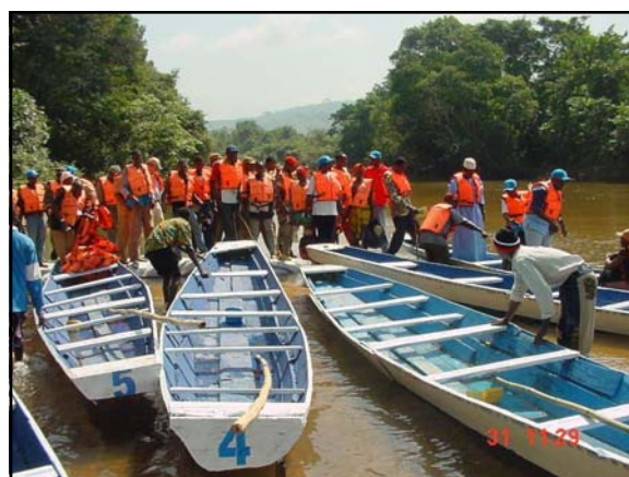
Launching of the repatriation movements on the Gueckedou-Kesseney (Guinée)- Foyah (Liberia) at the end of January 2006.

In addition, according to NRC monitoring reports, there are more than 120,000 spontaneous returns to Lofa County. Spontaneous returns comprise mostly persons sought refuge among communities in border areas of neighbouring countries during the war and were not registered with UNHCR.