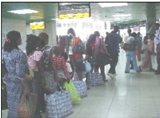
Liberian refugees from Nigeria upon departure for Monrovia. 2006/ UNHCR/ Babawali Owolabi.

The issue of total amount of luggage permitted has often deterred many