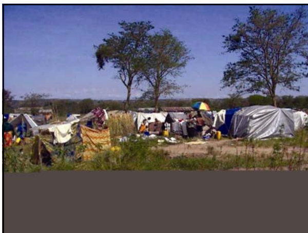
Influx of refugees from DRC / Ishasha, close to the border with DRC/ January 2006

As the elections approach in the DRC, UNHCR continues to closely monitor the situation and a contingency plan to receive and assist further new arrivals is in place. In total UNHCR assists 22,406 Congolese refugees in Uganda in close partnership with the Government and GTZ.