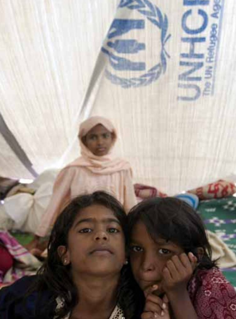
Sri Lanka. IDP children in a tent fashioned out of UNHCR canvas in Kantale.