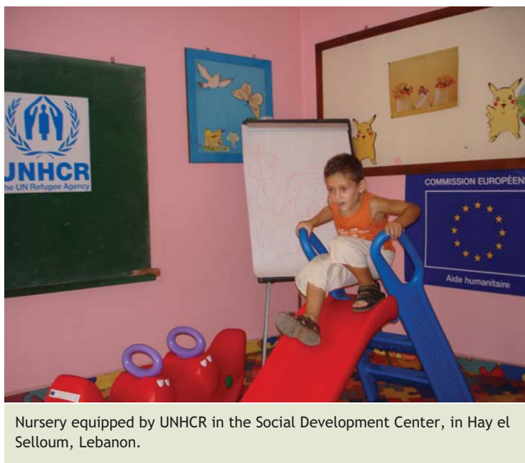
Nursery equipped by UNHCR in the Social Development Center, in Hay el Selloum, Lebanon.

Domestic needs and household support: Some 500 refugees detained in Lebanon were provided with basic items including mattresses, blankets, hygiene kits, sanitary materials and clothing. Another 8,500 refugees (85 per cent of registered refugees) received food, sanitary materials, diapers and other items, as well as cash grants. Prisons in the country were provided with heaters, ventilators and washing machines to support the well-being of detainees. The Office procured non-food items to support some 260,000 IDPs in case of an emergency in the country.