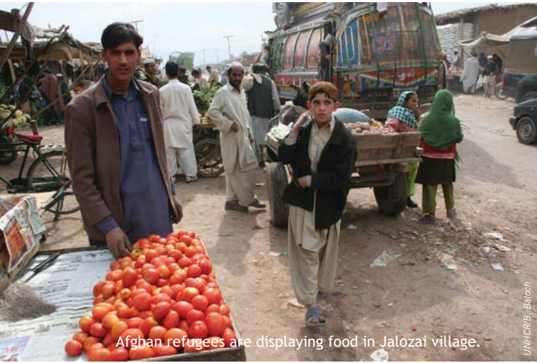
Afghan refugees are displaying food in Jaloza village.