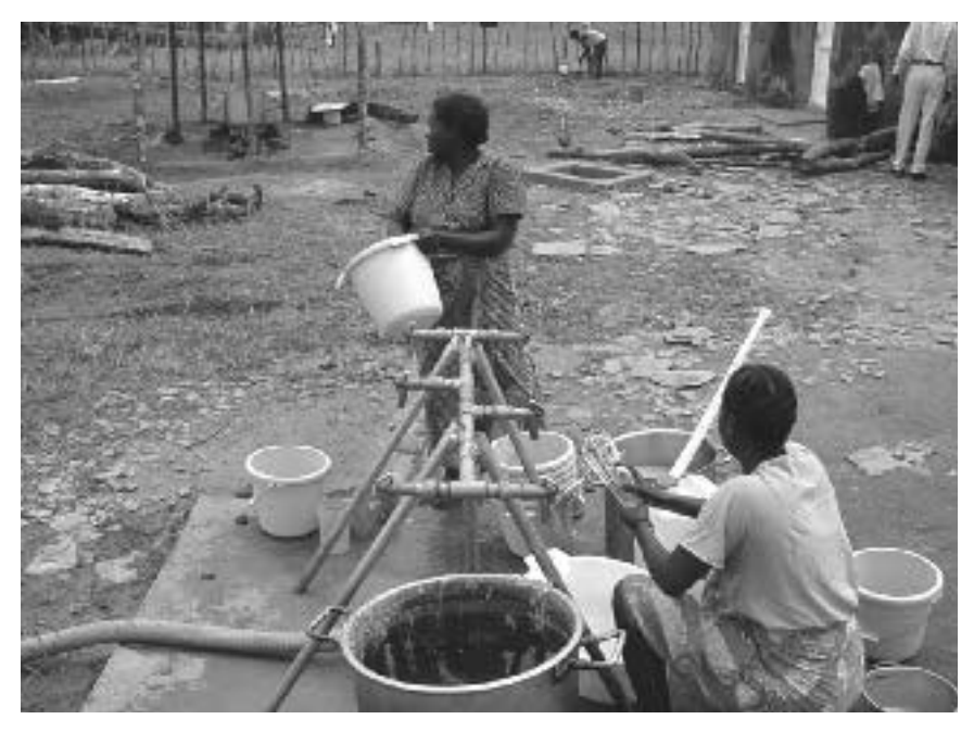
Living conditions are improved through water distribution systems. Here, women have access to potable water for domestic use.

Community Services: As part of the community services intervention, 34 women are attending handicraft training and 162 refugees (143 women) are attending literacy classes. Seven refugee teachers were trained to conduct these classes. Seminars were held for refugees on leadership, gender and HIV/AIDS prevention. Consultations on the 'Protection of Refugee, Returnee and IDP women' were held among the refugee and IDP population in Viana. As a result, one representative was sent to the Global Consultations in Geneva. The community centre set up in September 2000 in Luanda, contin-