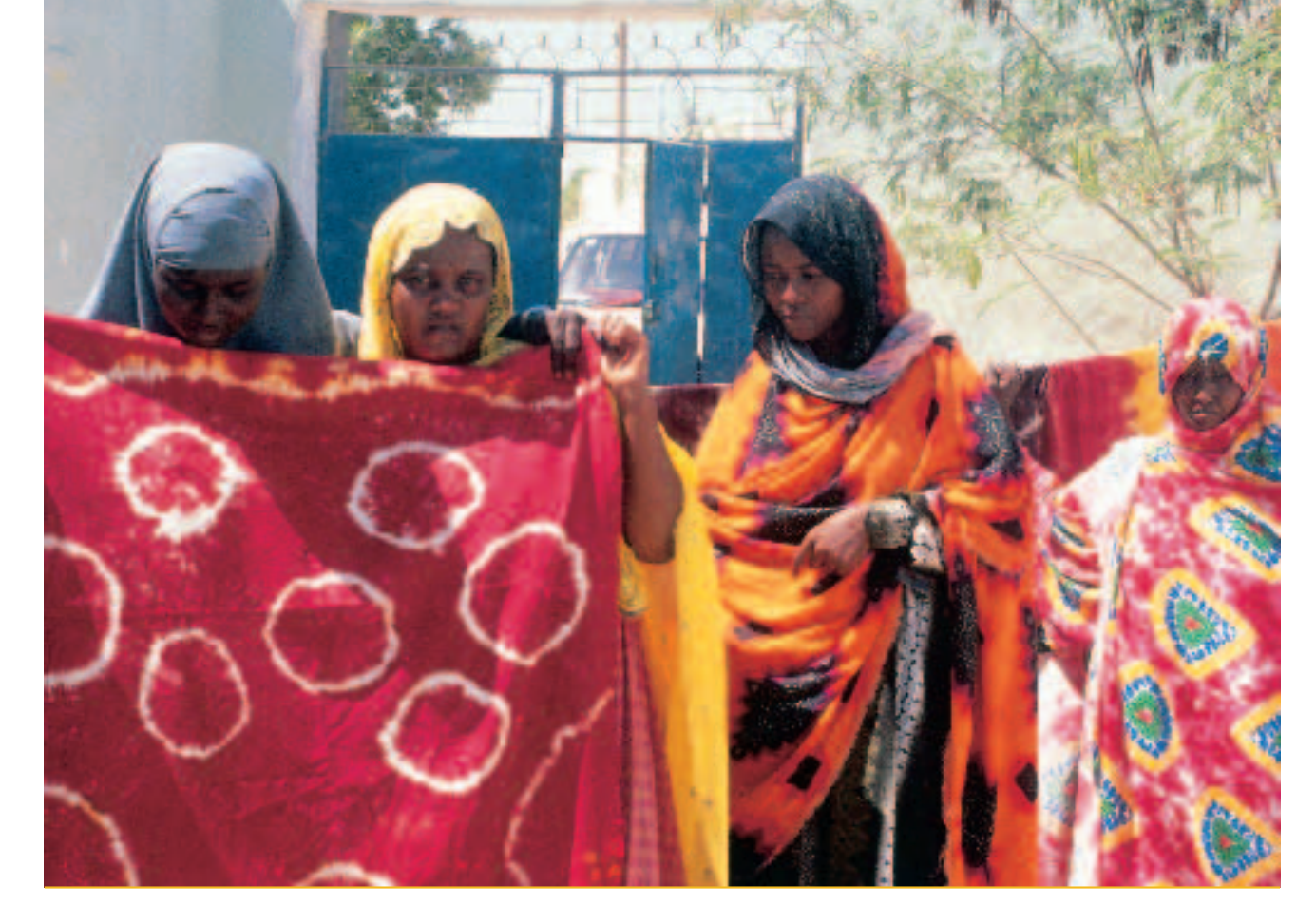
Somalia: Women in a UNHCR-funded tie and dye training project in Bossasso.

countries in the sub-region undertook needs assessments to identify vulnerabilities to sexual exploitation and abuse. The results of these assessments were applied to improve programme planning and to minimise the incidence of sexual exploitation of refugees.