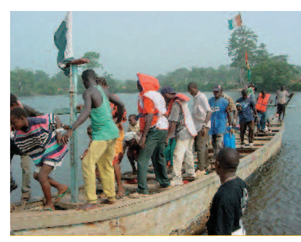
Côte d'Ivoire: Liberian refugees, in a canoe, ready to return to Liberia.

The overall situation in Chad was calm in 2002, apart from sporadic outbreaks of fighting in November in the north between the army and some rebel