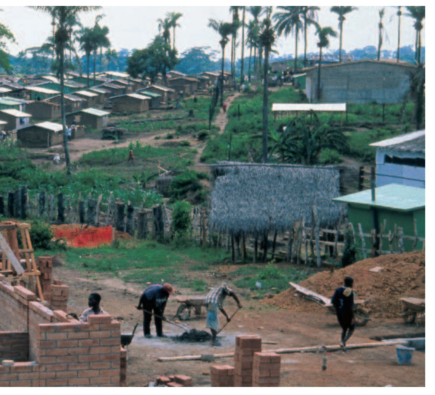
To accommodate the increased number of refugees who arrived in 2003, more shelters had to be constructed to house Liberian refugees in Nzérékoré.

and vocational training. Refugees living in the camps will benefit from free medical treatment, vaccination (yellow fever, measles) and reproductive health care. In general, food distribution will be essentially carried out by women and thereby empower them to increase their participation in camp management activities. Female refugees aged between 12 and 55 will continue to receive hygienic kits. Peer support groups will be organised for refugee adolescents to prevent the spread of AIDS. UNHCR will reinforce implementing partner capacity to protect children and women from exploitation and gender-based violence.