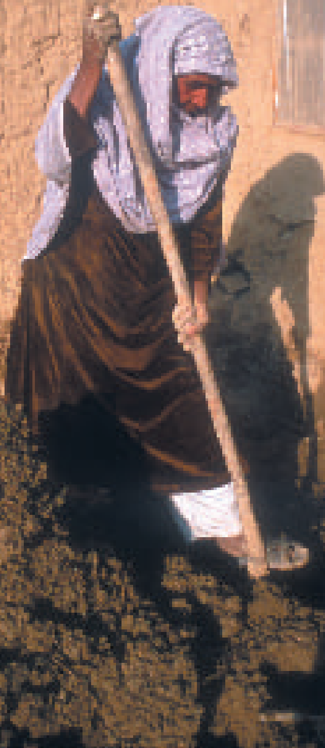
A widow helping her sons to rebuild their house in Kabul.

Shura (council) was established by UNHCR and Ministry for Repatriation and Reintegration (MoRR).