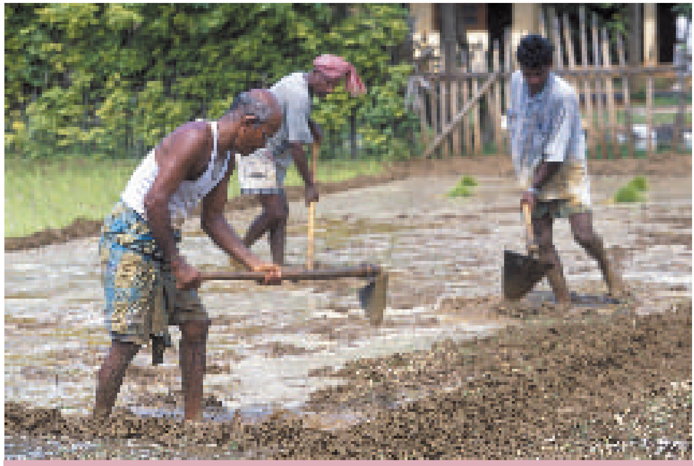
IDPs in Tellepelai benefit from a UNHCR agricultural programme for psychiatric patients of the hospital.

the Sri Lankan Government and other national institutions, as well as with international NGOs. The network intervenes to prevent human rights abuses, informs IDPs about their rights and provides access to legal services. In addition, a comprehensive study on land and property was concluded and its recommendations were shared with the Government and the LTTE. This study is part of UNHCR's efforts to ensure that the rights of IDPs receive sufficient attention in the peace negotiations.