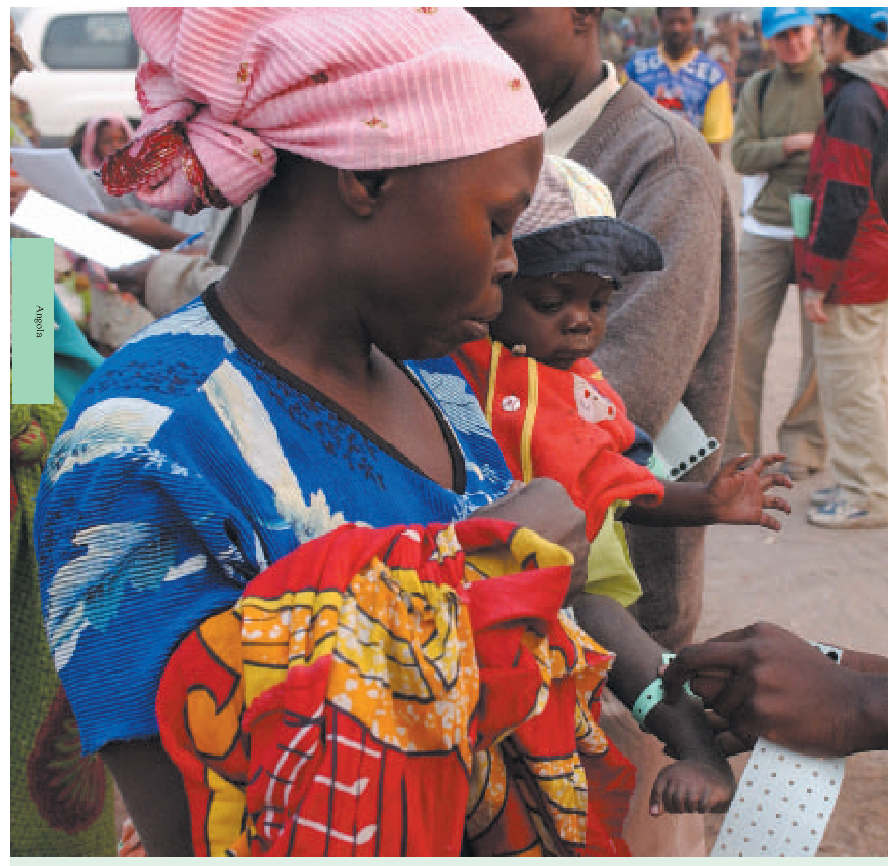
Under the voluntary repatriation of Angolan refugees from DRC, over 100,000 have returned home since 2003.

the rehabilitation and reconstruction of the areas of return.