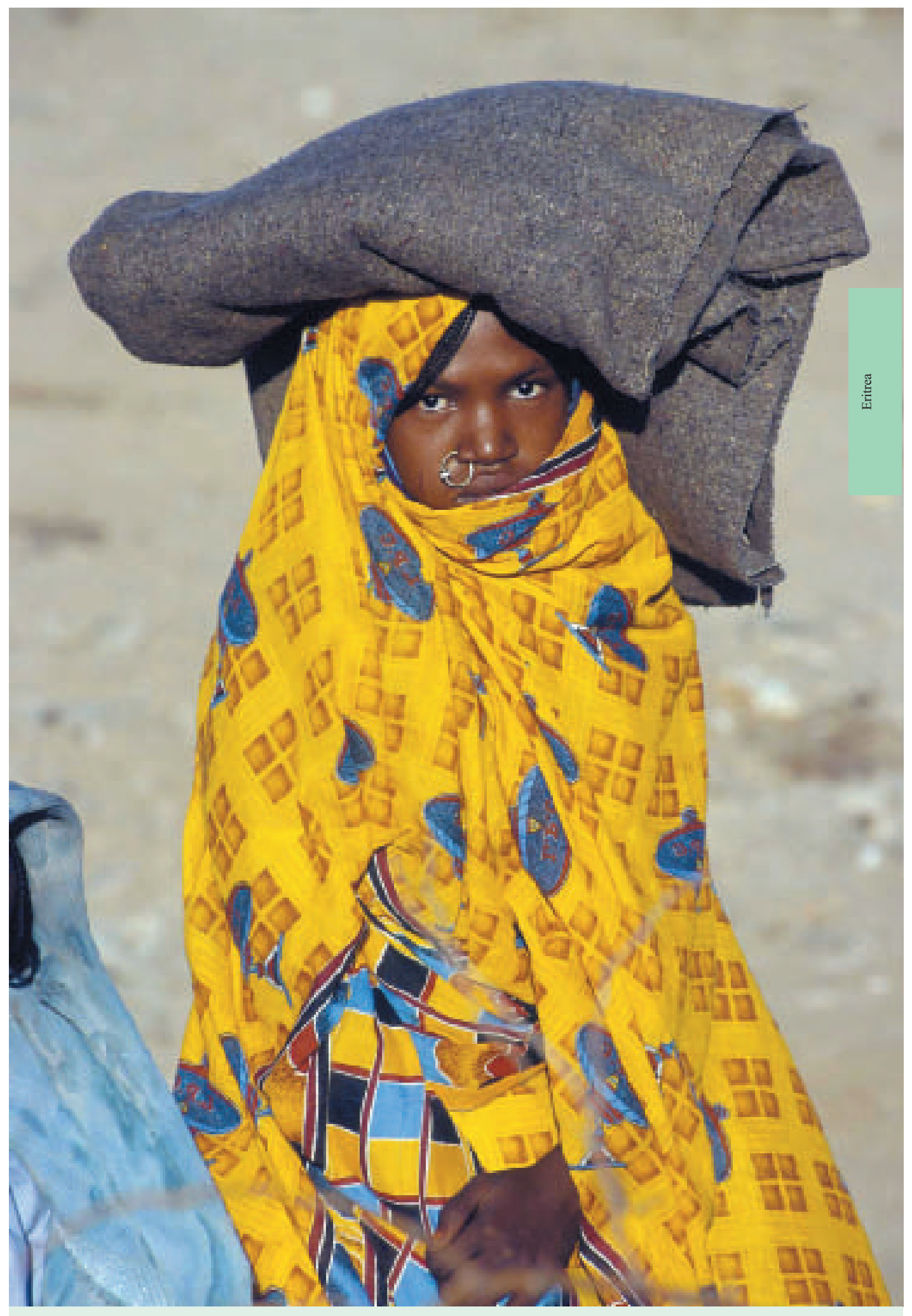
A returnee girl from Sudan having just received a blanket given out by UNHCR as part of the distribution of non food items.