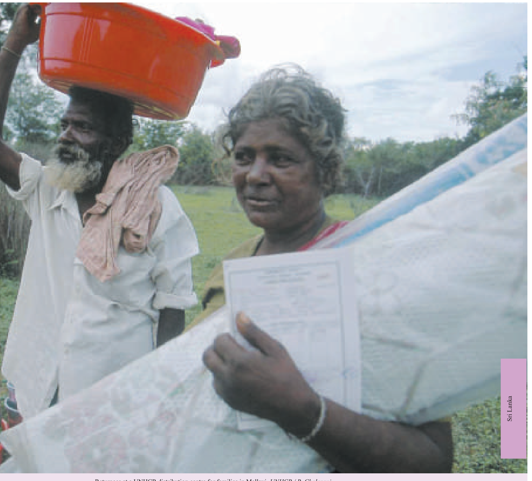
Returnees at a UNHCR distribution centre for families in Mallavi.

UNHCR will thus support various communitybased monitoring, intervention and capacitybuilding mechanisms.