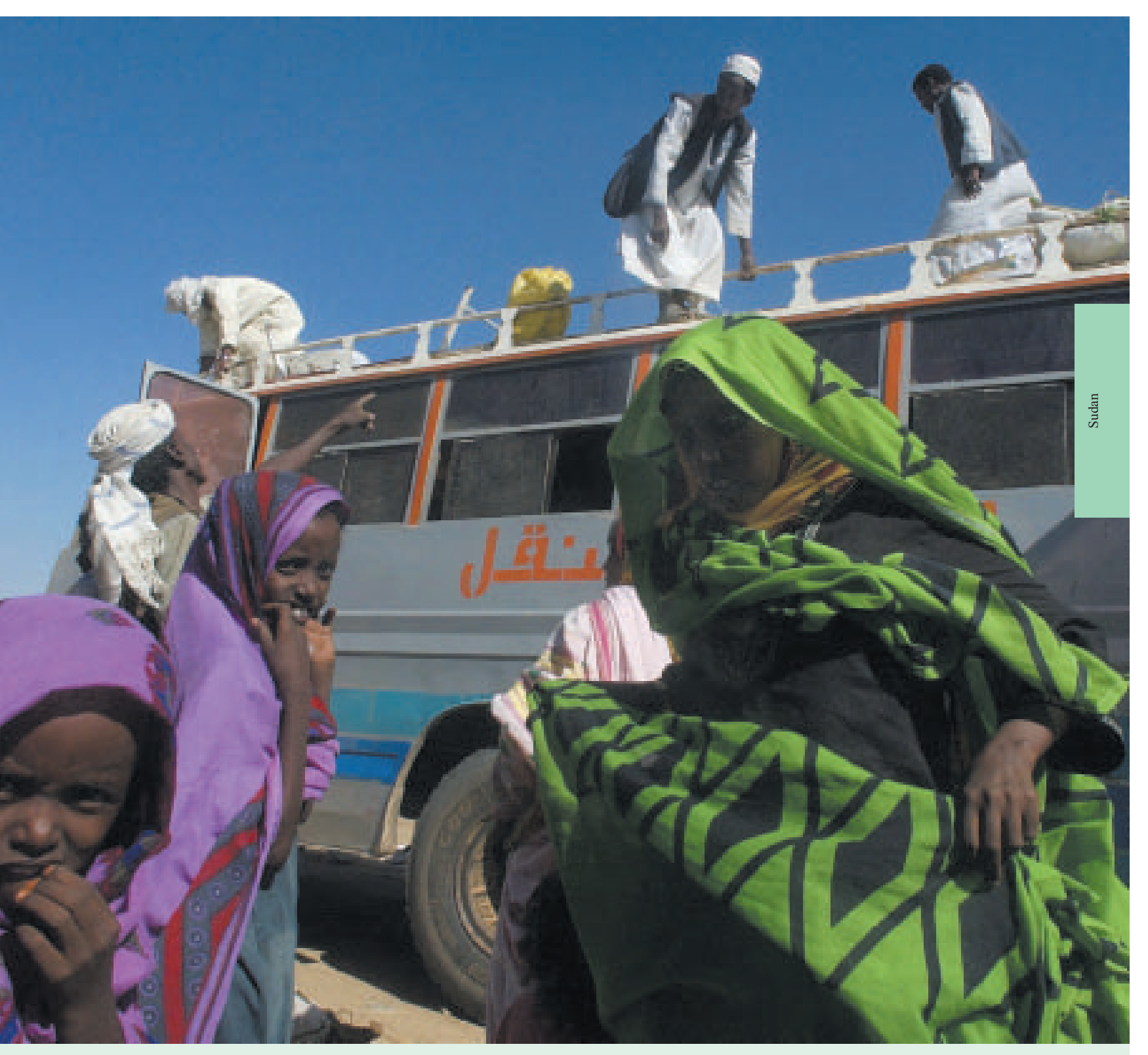
An Eritrean family of returnees waits as the Sudanese buses are unloaded, and then passengers switch to Eritrean buses - at the border between Sudan and Eritrea for the rest of the journey home.

Ugandans (almost 8,000) and DRC Congolese (1,500). Individual refugees who wish to repatriate will be assisted to return voluntarily to their countries of origin with the assistance of COR. In 2005, UNHCR will facilitate the resettlement to third countries of 1,000 Ethiopian and Eritrean refugees with specific protection needs. UNHCR will also explore the use of resettlement as a durable solution for groups of refugees.