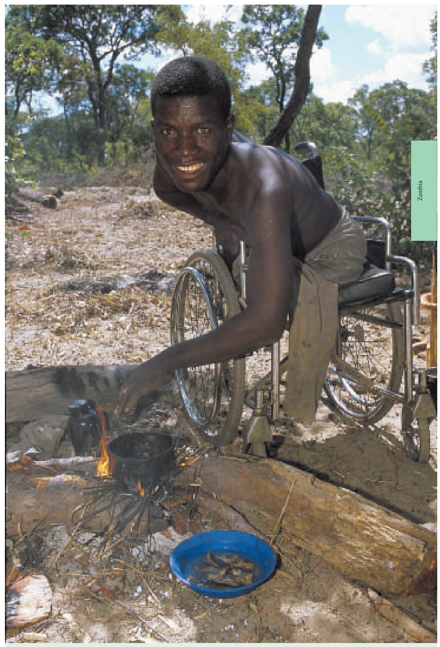
A disabled Angolan refugee in Nangweshi Camp cooking his midday meal.