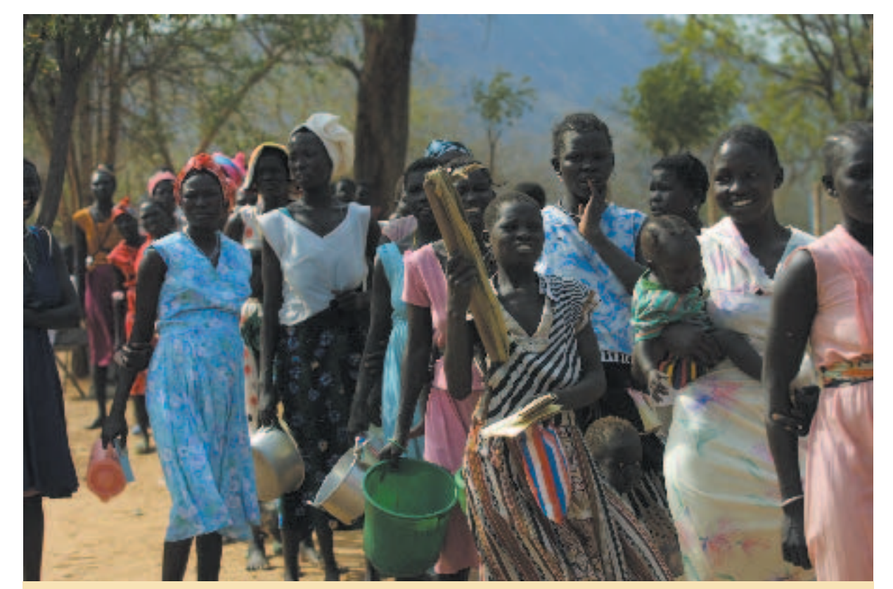
Ethiopia: Sudanese refugees at Bonga camp receive basic humanitarian assistance provided by UNHCR and its partners.

UNHCR also covered expenditure on interpretation and translation services as well as photographic supplies, in-country transport and processing fees related to resettlement.