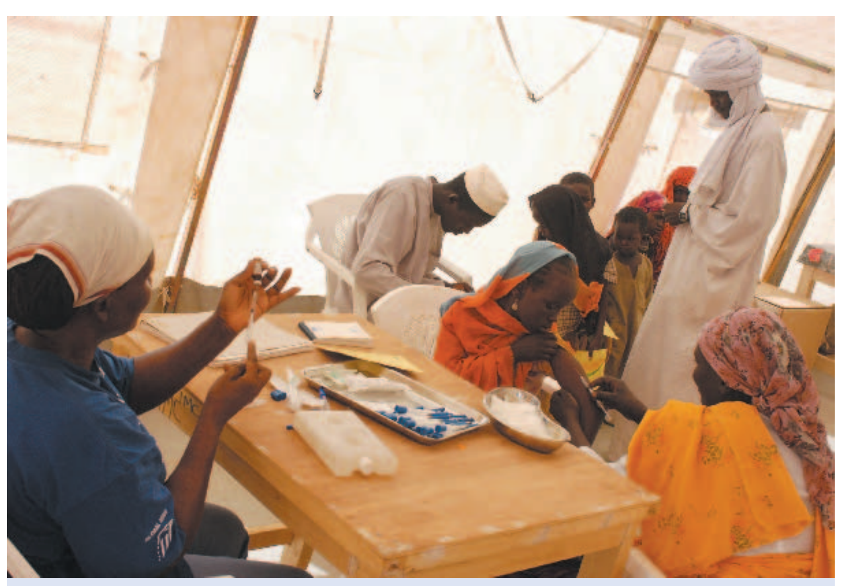
Chad: Refugees from Sudan – UNHCR coordinated the administration of vaccinations against measles for newly arrived refugees in Mile camp. The refugees had first stayed several weeks in Tine after fleeing Darfur, and were then transported to Mile by UNHCR. An implementing partner, IMC, was in charge of health in the camp.

ILO and UNHCR recently launched a new global initiative aimed at supporting the livelihoods of refugees, returnees and IDPs. The rapid deployment of ILO livelihood experts in Kenya, Pakistan, Sierra Leone, Uganda and Zambia has already proven a highly effective way to support the reintegration of returnees and IDPs in their countries of origin, as well as the self-reliance of refugees in the asylum context.