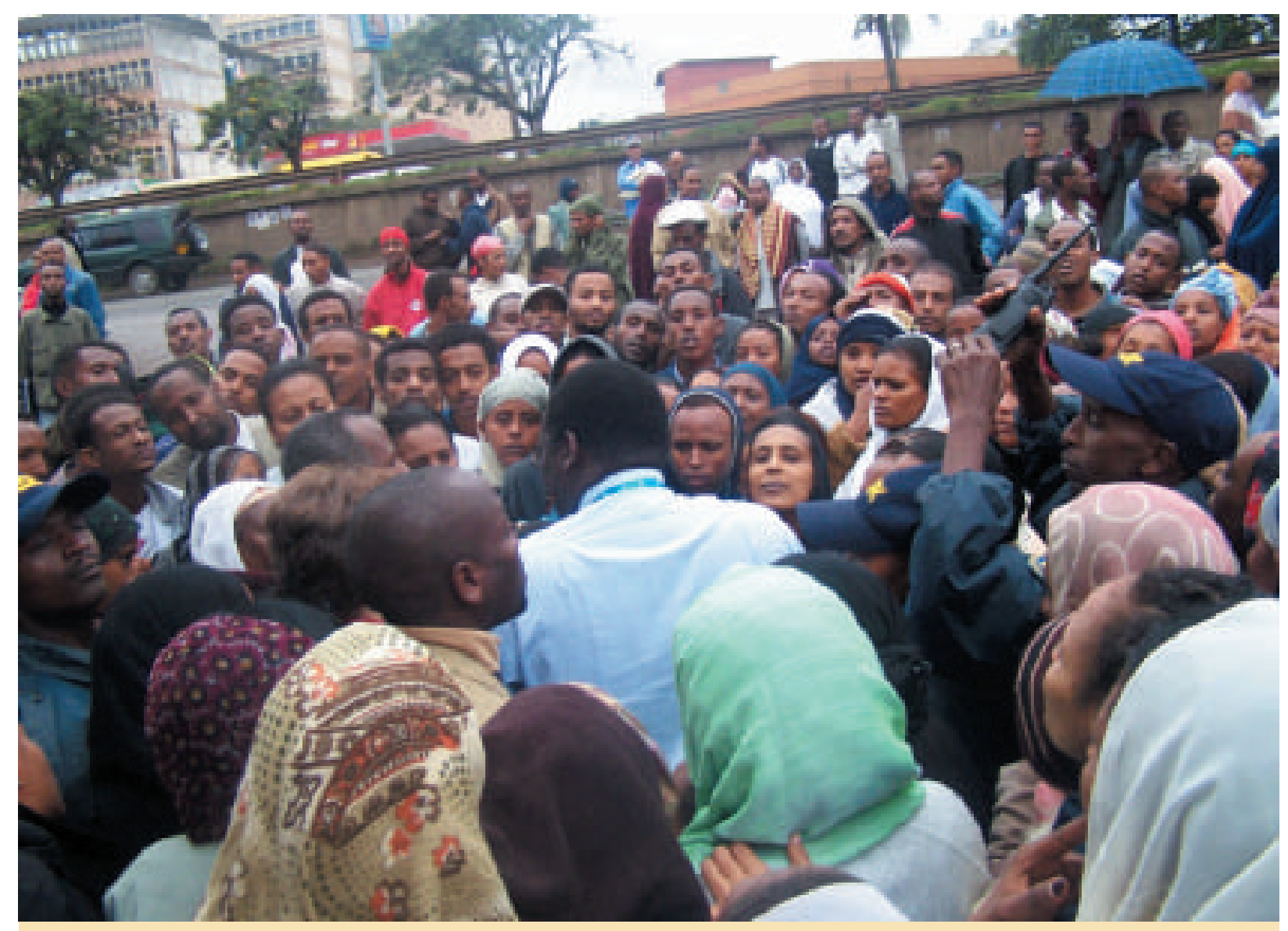
A UNHCR officer talking to refugees and asylum-seekers outside the Nairobi office.

UNHCR will continue to work closely with the Government of Kenya, focusing on capacity-building activities, so as to hand over certain responsibilities to the Government when the Refugee Act is adopted. The Kenya Office will coordinate and plan its implementation of the Sudanese repatriation operation with the Regional Support Hub, other UNHCR offices assisting Sudanese refugees and returnees, and the Kenyan and Sudanese authorities. The Office will collaborate with embassies of resettlement countries. It will negotiate where possible with authorities in countries of origin to facilitate the return of refugees in Kenya.