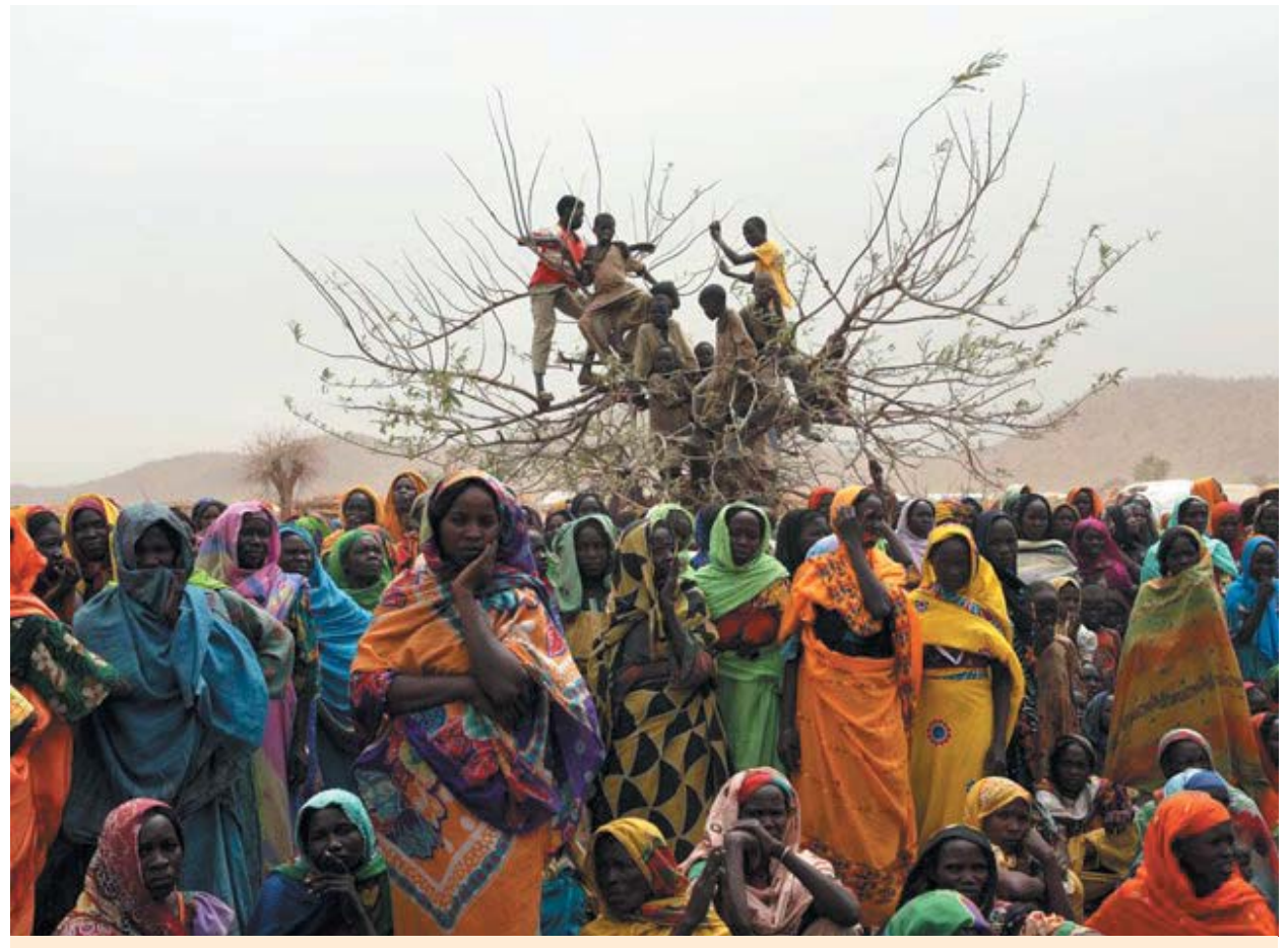
Displaced women in the Goz Beïda area who fled repeated attacks at the border before reaching sanctuary in a UNHCR-run settlement.

people and humanitarian workers, UNHCR supported the posting of some 300 Chadian gendarmes in and around refugee camps and in the major towns in eastern Chad. Cross-border attacks by the Janjaweed militia have displaced some 50,000 Chadians around the Goz Beïda area. Most of these IDPs are in scattered settlements and villages away from the border, while some are settled closer to refugee camps in Goz Beida. The 12 refugee camps in the east remain at risk, despite assurances by all sides that refugees and humanitarian workers will not be targeted.