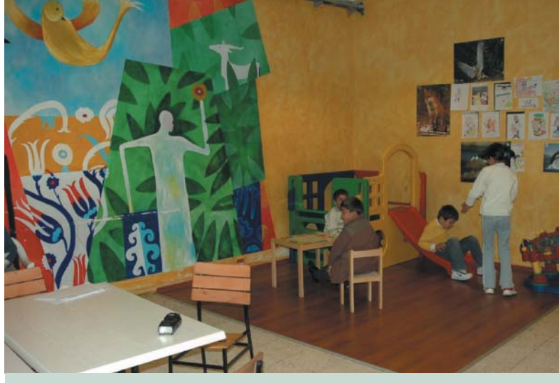
UNHCR has arranged a play area for children of asylum-seekers to wait while their parents put forward their claims. UNHCR Ankara.

UNHCR's 2007 programme in Turkey has two components. The first is an annual programme covering the Office's objective to strengthen asylum in Turkey and find solutions for refugees, besides providing them their