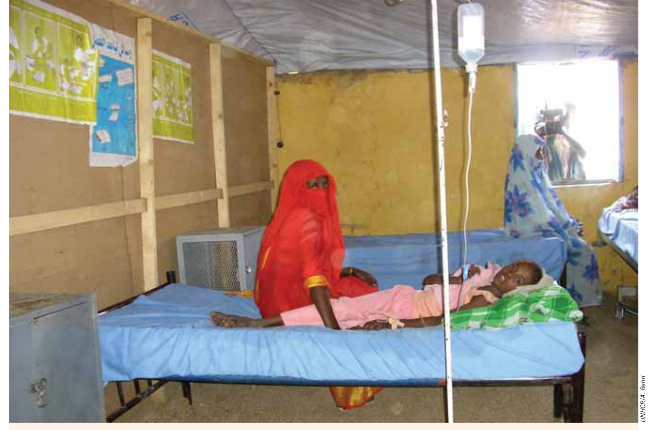
Malaria patients in a health centre in Kilo 26 refugee camp.

Domestic needs and household support: The Office continued to provide non-food items to refugees with specific needs and newly arrived asylum-seekers. Some 12,000 women refugees received sanitary napkins in camps.