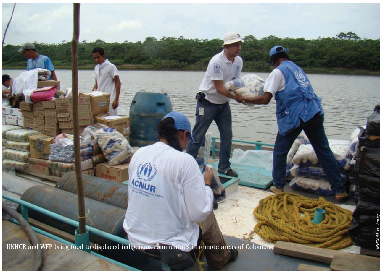
UNHCR and WFP bring food to displaced indigenous communities in remote areas of Colombia.

Ecuador is one of the eight pilot countries for UNHCR's Global Needs Assessment initiative. As a result of the initiative, UNHCR will seek to improve the country's asylum system and provide humanitarian assistance to all persons in need of international protection, and to host communities.