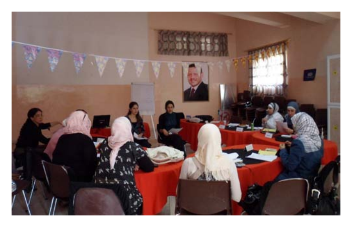
Training of household survey interviewers.

We visited Jordan to examine the extent to which Iraqi refugees use family planning services in Amman. We wanted to learn about what the Iraqi people think about family planning and whether they are able to obtain contraceptives; how many people use them; and what family planning services are available to them in health facilities.