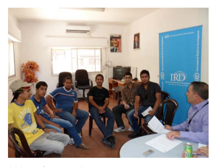
Adolescent focus group discussion.