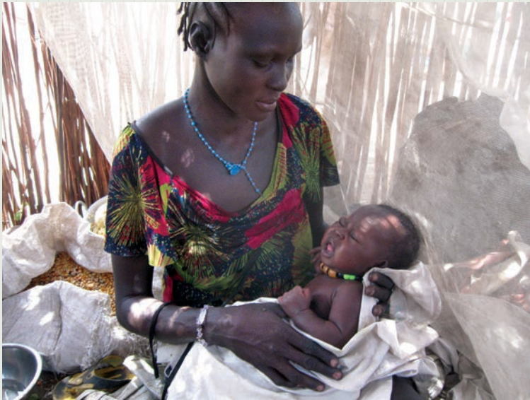
A displaced mother with her hungry baby in South Sudan's Maban county.