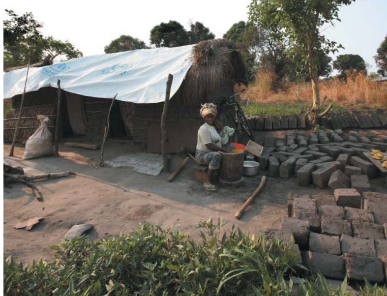
Recently returned refugees rebuild their lives with UNHCR's help.