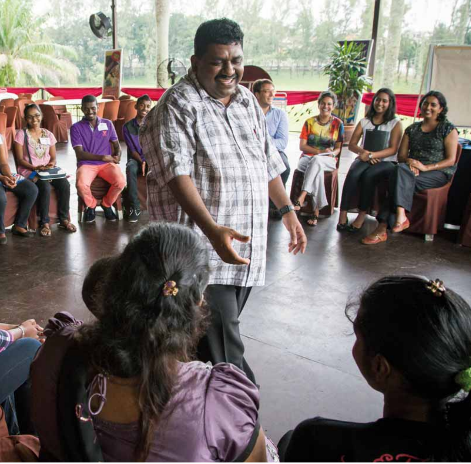
Consultations with stateless children and youth in Malaysia in progress.

cently concluded: "[B]eing stateless as a child is generally the antithesis of the best interests of children."5