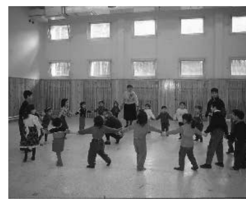
Czech Republic: Children / asylum-seekers from various countries in a primary school.

In the area of training, a new trend is emerging to create processes of on-the-job training that include