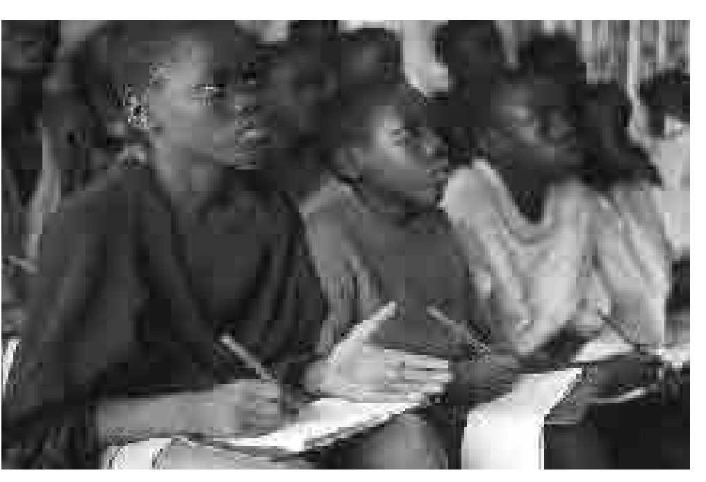
Burundi: Education often provides a brighter future. Rwandan refugee children are given educational material to attend school.

The continued lack of concrete results in the Arusha Peace process (for Burundi) and in the implementation of the Lusaka Cease-fire Agreement (in the DRC), meant that large-scale repatriation from countries of asylum could not take place. Despite these setbacks, some progress was nevertheless made