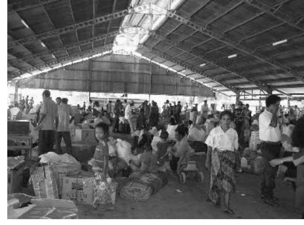
Returnees from West Timor in a transit centre in Dili.

The primary durable solution sought for East Timorese refugees was their voluntary repatriation to East Timor (the vast majority returning from West Timor). Although no accurate registration has ever been undertaken in West Timor, UNHCR estimates that there were around 70,000 East Timorese refugees remaining in Indonesia, mainly in West Timor, at the end of 2001.