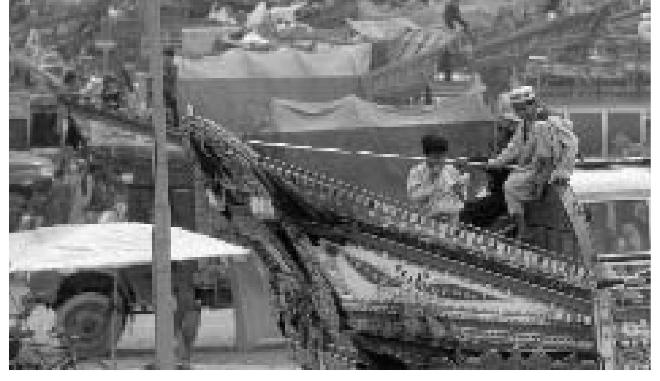
Pakistan: UNHCR registration in Takhta Baig transit centre near Peshawar for the voluntary repatriation of Afghan refugees.

out the region who are unable to return home (providing legal counselling and conducting interviews for resettlement).