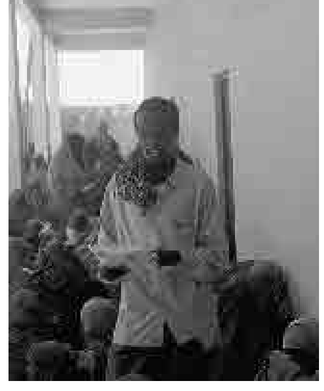
School in Bossasso built with UNHCR's assistance.

Some 250 urban refugees in "Somaliland" will continue to benefit from international protection and assistance, while durable solutions including third country resettlement or voluntary repatriation are being explored.