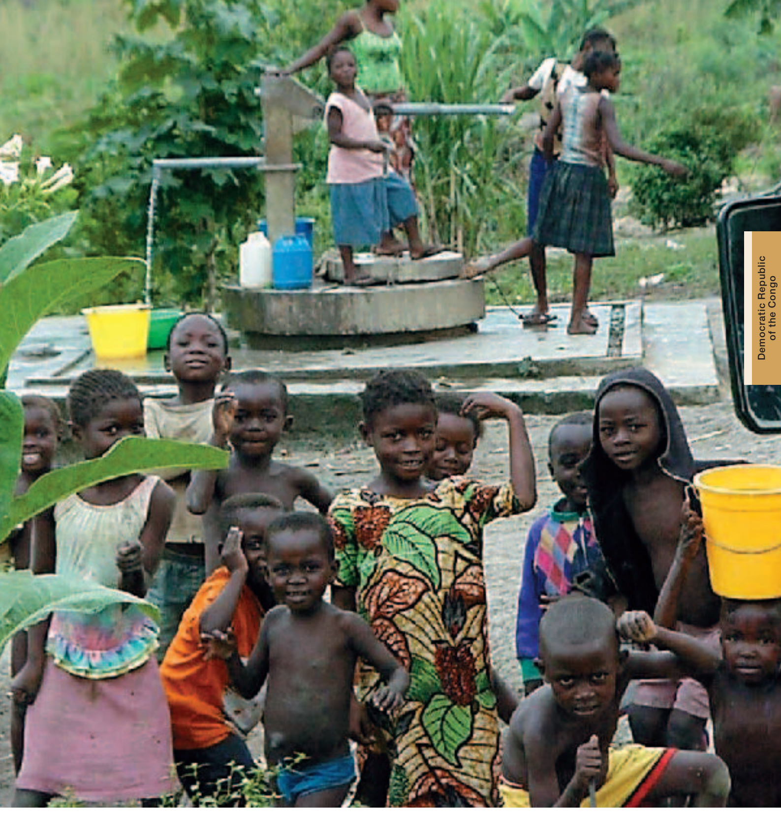
Refugee children at a water stand in Kilweka.

In territories formerly controlled by rebel movements, exrebel soldiers divested of leadership structures (pending their integration into the national army) have shown a propensity for continued insurgency. There is a risk that the localised power vacuum in these areas could lead to more generalised insecurity if not addressed effectively.