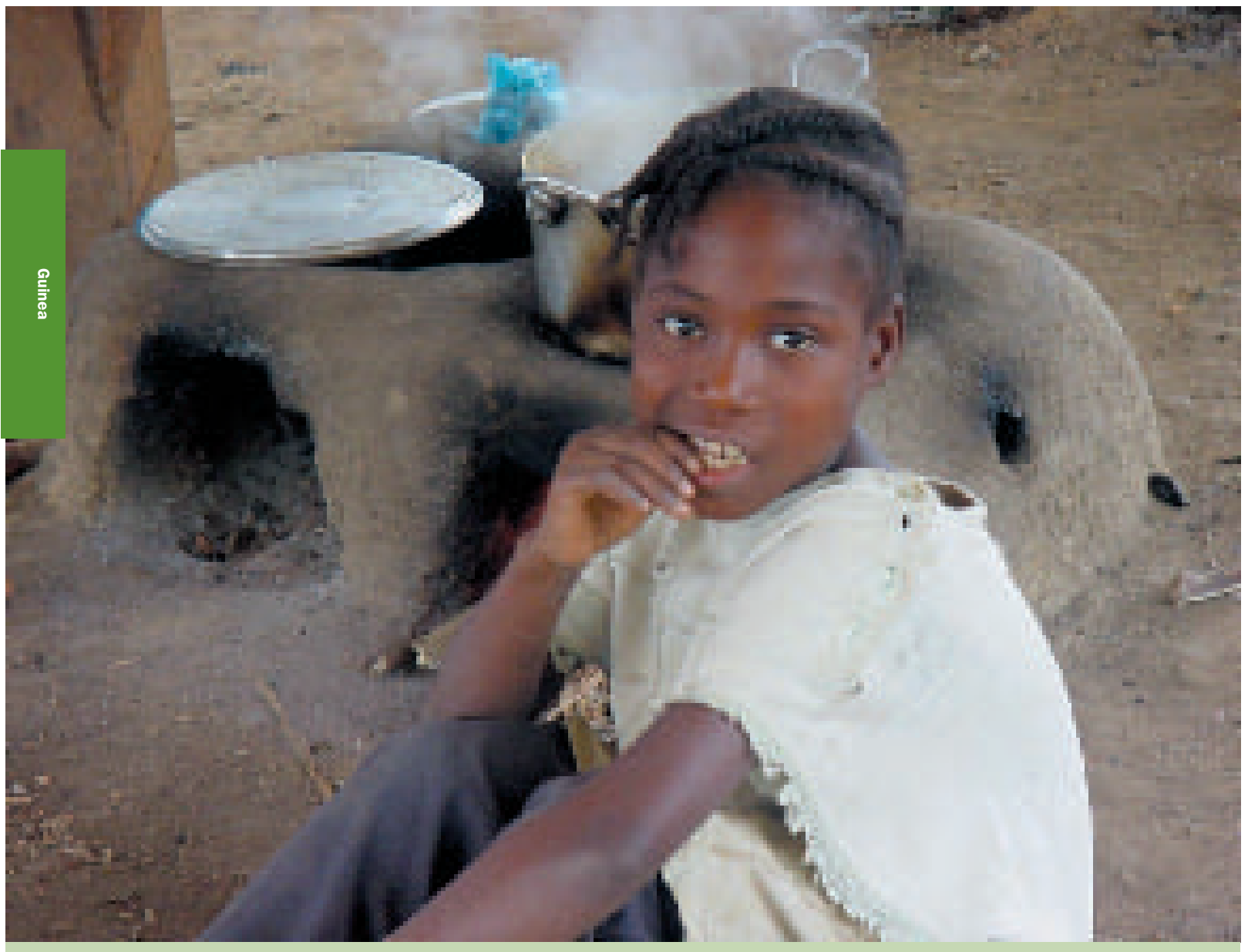
A young girl who had just arrived was waiting to be fed during the registration of new arrivals at Sédimay, Macenta.