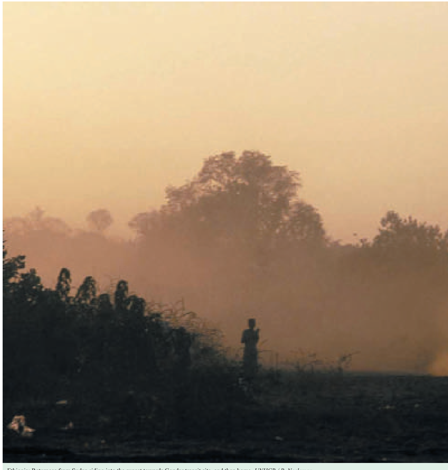
Ethiopia: Returnees from Sudan riding into the sunset towards Gondar transit site, and then home.

Army in Adjumani displaced some 26,000 refugees. Meanwhile, violence and conflict in southern and central Somalia continue to hamper humanitarian access to the vulnerable. This situation has been further compounded by widespread and severe drought resulting in food and water shortages in the northern pastoral and southern agricultural areas of Somalia. In Kenya and Ethiopia emergency supplementary feeding operations have been established to remedy breakdowns in the supply of food (aggravated by drought in both countries).