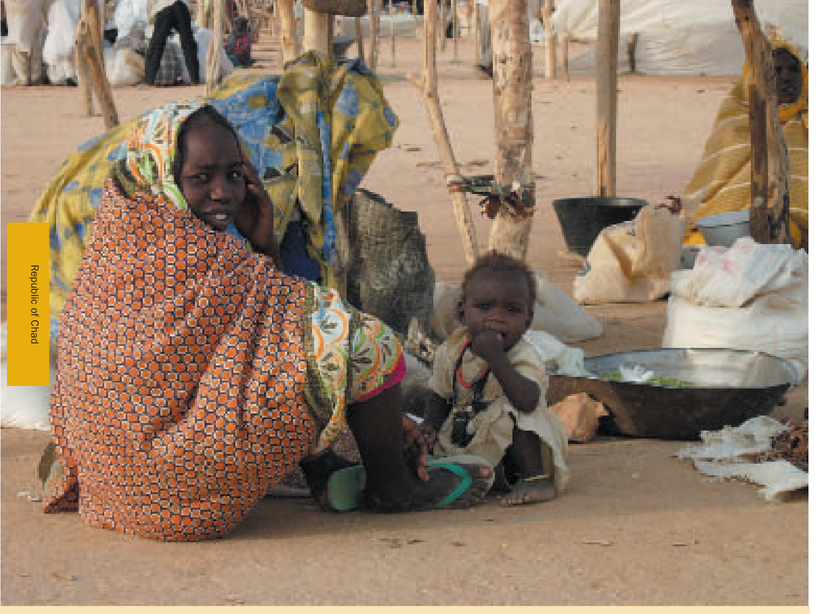
Sudanese refugees from Darfur at the market place in Iridimi camp.