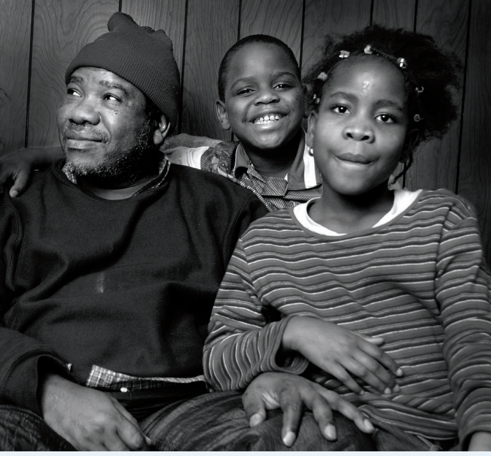
USA: Somali Bantu refugees resettled in Utica, New York State.

represents the highest number of UNHCR referrals to the country since the late 1980s. Moreover, the quick and positive response by the United States to UNHCR's emergency resettlement request for 450 Uzbeks facing serious protection problems in Kyrgyzstan was instrumental in finding a solution to this complex situation. Continued United States support for UNHCR's programmes was reflected in an additional contribution of USD 4.5 million for strengthening UNHCR's resettlement and related refugee status determination programmes. These efforts were complemented by the creation of a new Refugee Corps of officials who will be responsible for the adjudication of refugee claims overseas.