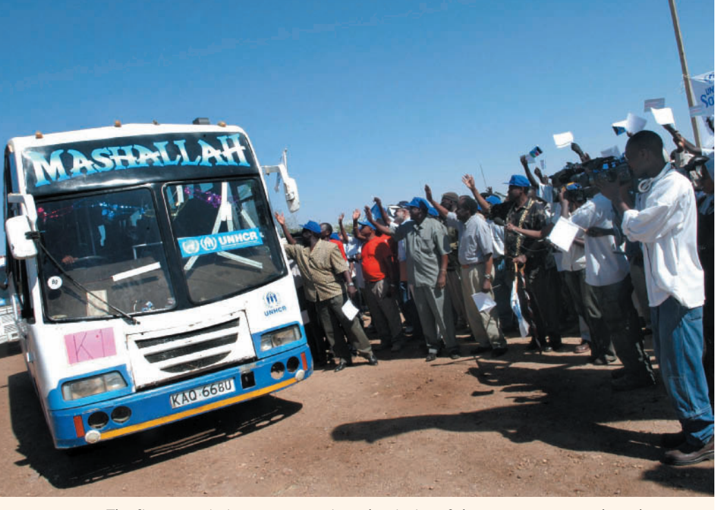
The first repatriation movement since the signing of the peace agreement brought refugees to South Sudan from Kakuma camp in Kenya on 17 December 2005.