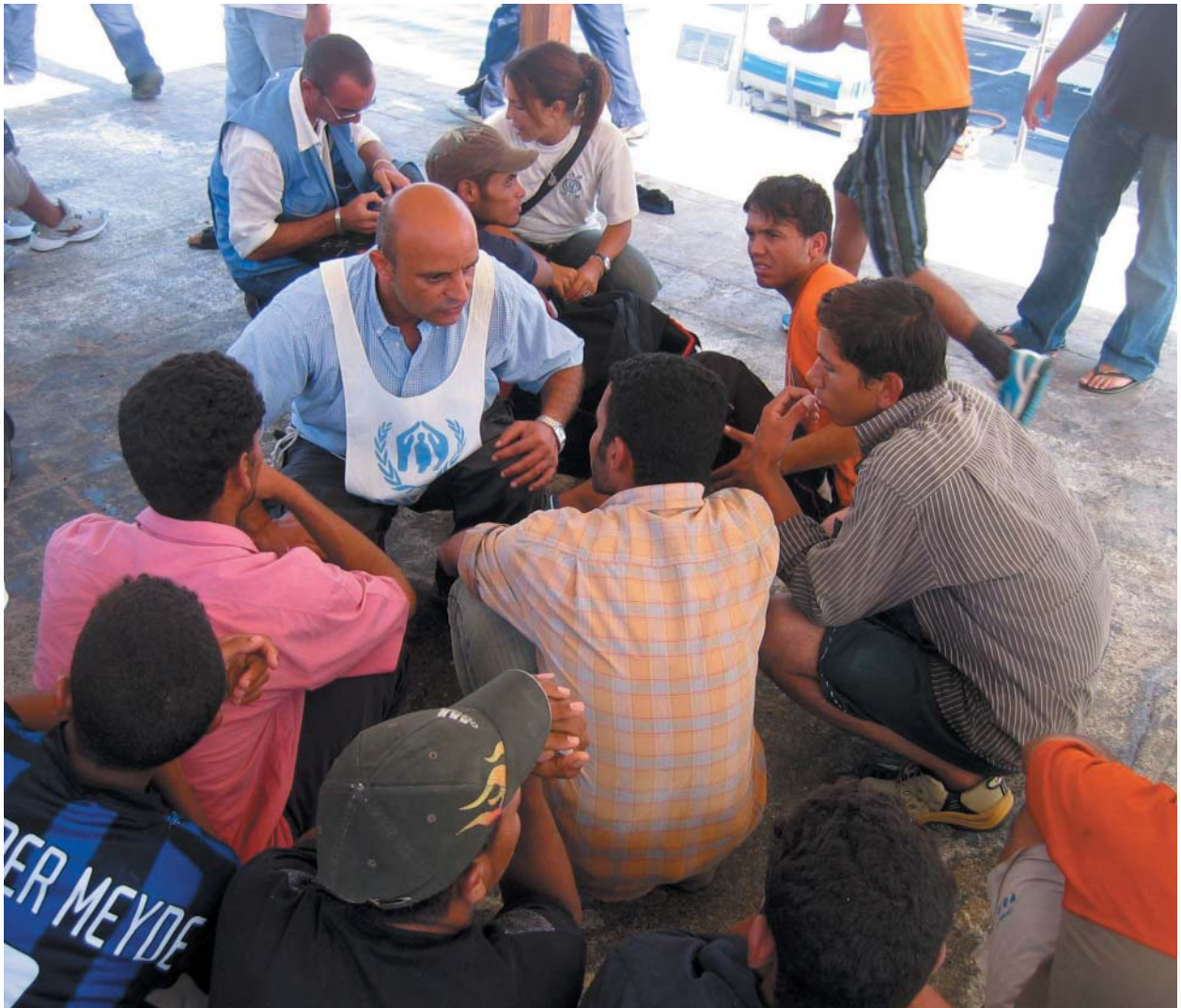
To establish who needs international protection among mixed migration flows, UNHCR insists on access to migrants who make it to European shores, like this group intercepted by the Italian Coast Guard off the coast of Lampedusa.