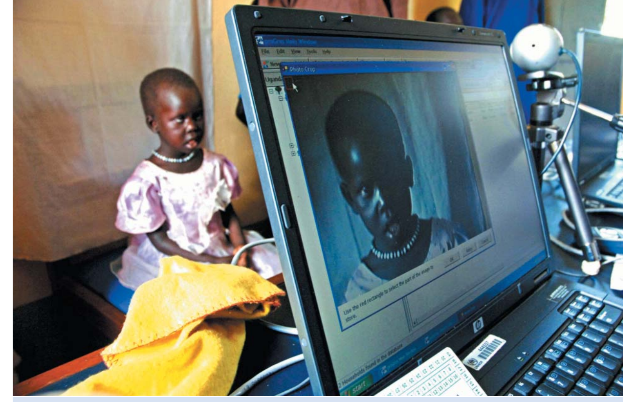
Registration of newly arrived Sudanese refugees in Uganda.

printing of identity cards and building the capacity of both partners and governments. While the introduction of the proGres registration software will continue to be led by Headquarters, UNHCR's network of field-based regional registration officers will take on additional responsibility in providing support to partners and governments. Further improvements to the quality and availability of documentation given to refugees and others of concern, as well as to the various uses of registration data to support protection, assistance and durable solutions activities, will also be priorities in 2007.