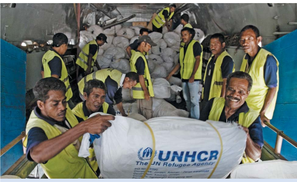
In 2007, UNHCR will aim at building its capacity to respond to emergencies of up to 500,000 people.

For details concerning emergency-related projects, please refer to the Strengthening emergency response chapter in Part I.