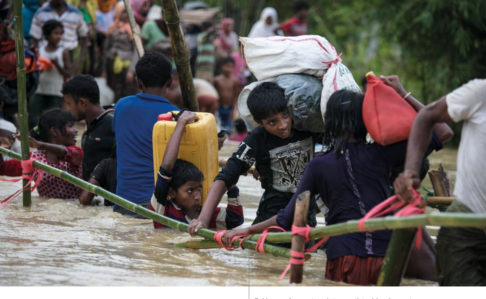
1.2 OPERATIONAL RESPONSE TO ADDRESS CROSS-BORDER DISASTER DISPLACEMENT

In some cases, UNHCR is operationally involved in situations of cross-border displacement linked to sudden or slow onset natural hazards. For example, UNHCR staff provided support to persons displaced across border from Haiti to the Dominican Republic following the 2010 earthquake. In Haiti, UNHCR provided assistance including tents and non-food items, and protected affected populations together with OHCHR. In the Dominican Republic, UNHCR led the international community's protection response.