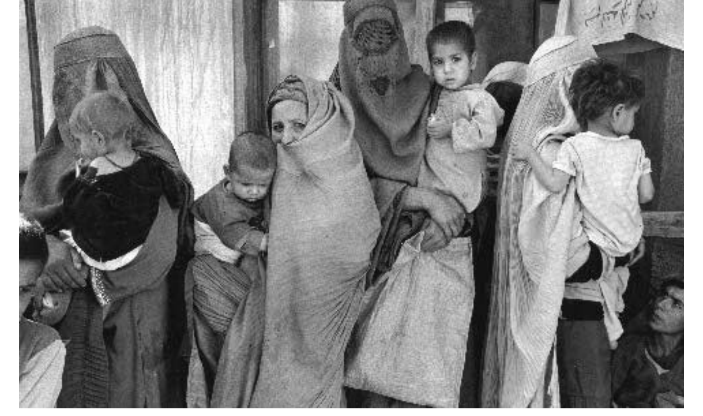
Afghanistan was one of the largest humanitarian crisis – hundreds of thousands of civilians were uprooted. IDPs at a food distribution centre in Kabul.

assisted some 250,000 new refugees in addition to the 1.2 million refugees already living in refugee villages there. In Afghanistan, the number of internally displaced persons in the country nearly doubled to an estimated 1.2 million.