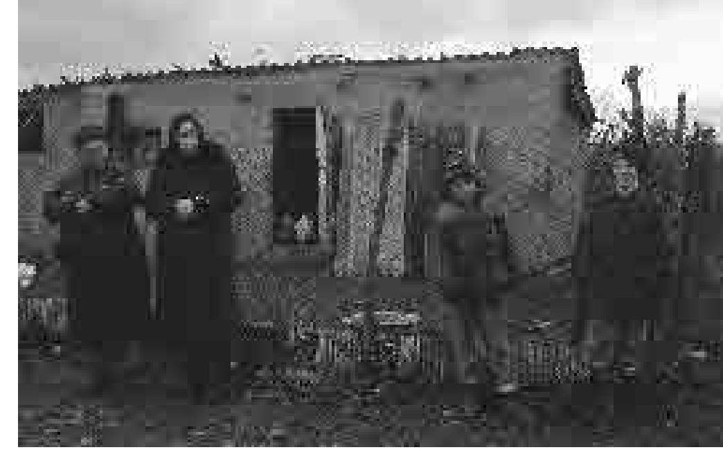
Russian Federation: IDPs from Chechnya outside their temporary home in Ingushetia.

determination of refugee status have not yet been put in place. UNHCR therefore continued under its mandate to determine the eligibility of a growing number of asylum-seekers and to search for longterm solutions for refugees. UNHCR helped in establishing a temporary protection regime from which many Afghan and Chechen refugees have