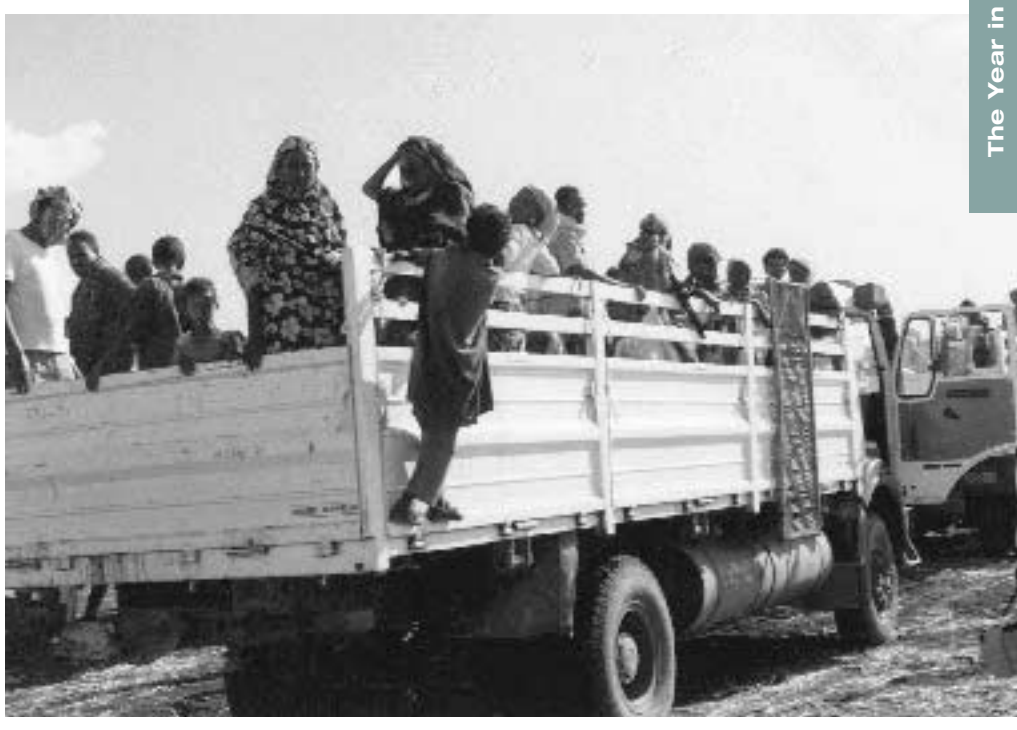
Ethiopia: Somali refugees return home to their villages in Northwest Somalia.

The impact of the events of September 11 on the work of the Office has been considerable, and has yet to be fully measured. The military action that followed these events, leading to the collapse of the Taliban regime in Afghanistan, opened unexpected opportunities for the return of thousands of refugees, particularly from Pakistan and the Islamic Republic of Iran where many have been leading a precarious existence for many years. On the negative side, however, the fear of terrorism has fuelled intolerance and distrust towards foreigners. In such a context, asylum-seekers and refugees have tended to become prime suspects. This poses considerable challenges to UNHCR to ensure that refugees are afforded international protection.