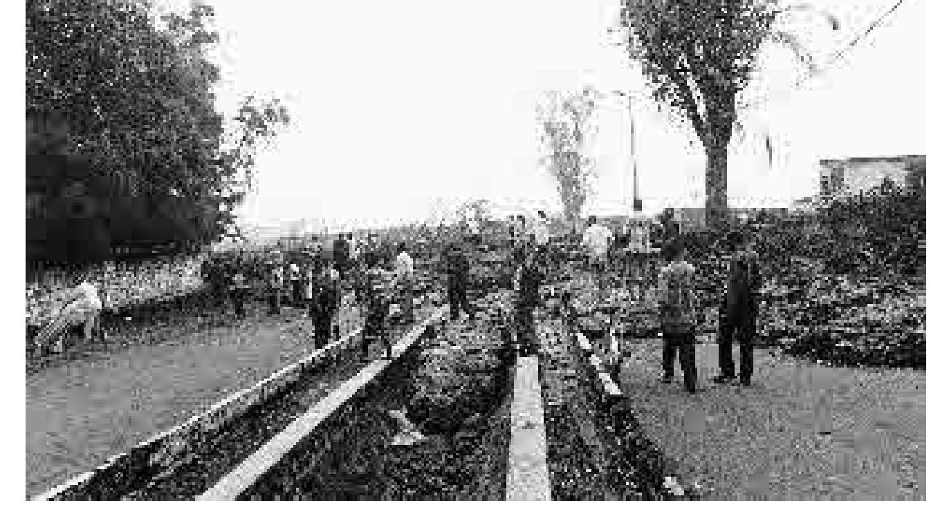
After the eruption of Mount Nyiragongo, the town of Goma was devasted. Tens of thousands of Congolese became homeless.

This is not easy, considering the problems they routinely contend with, such as: insufficient or late delivery of funding, partial regional coverage (geographical restrictions), restricted access to refugees (security and/or logistical conundrums) and their own restrictive mandates.