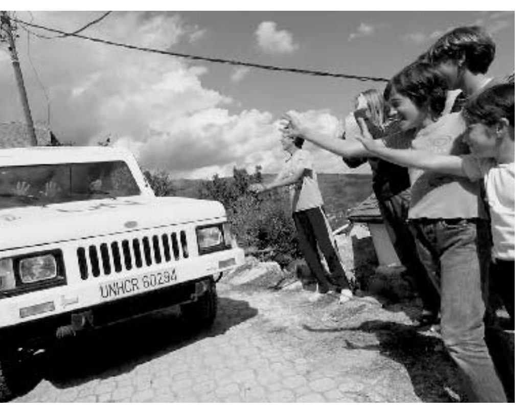
Returnees in Tetovo.

the issue of statelessness and of unresolved citizenship status with various actors including the international organisations involved.