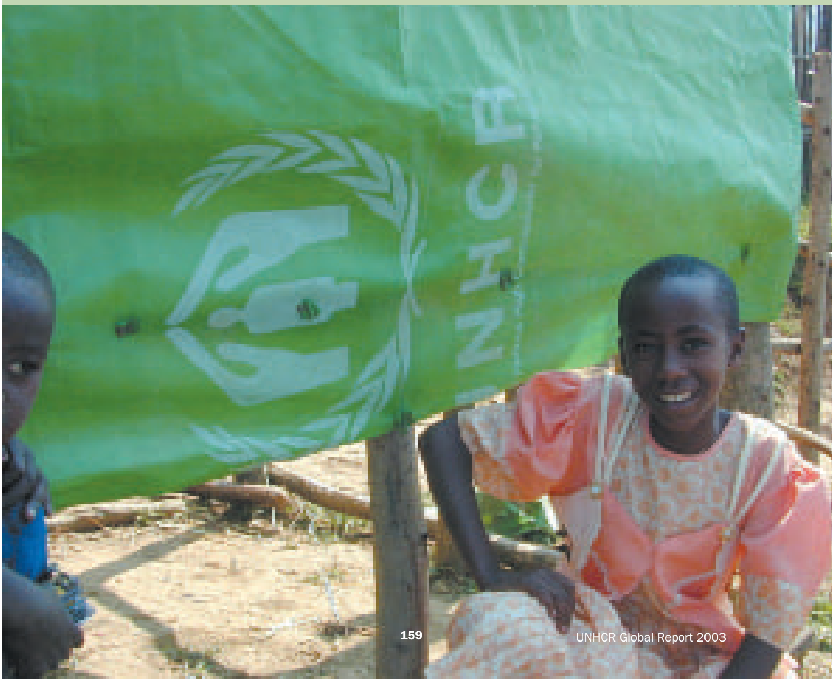
A Congolese refugee girl in front of her "tented" home at the Kiziba refugee camp near Kibuye.

Health/Nutrition: All refugees had access to preventive and curative primary health care services. Cases requiring special treatment were referred to local hospitals. Over 84,000 consultations were carried out at the health centres, resulting in 1,260 cases of hospitalization and more than 2,500 referrals. Supplementary and therapeutic feeding programmes helped 1,854 refugees. UNHCR delivered sensitization campaigns and counselling on sexually transmitted infections (STIs), HIV/AIDS and SGBV. Various training activities were organized for medical personnel, community health workers, and traditional birth attendants.