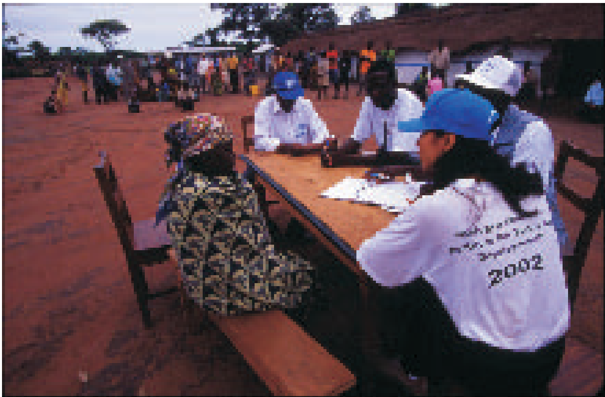
Congolese refugees from the DRC in Kala camp, Kawambwa. New arrivals being interviewed.

Income generation: A variety of projects and training activities were undertaken in all camps. Special