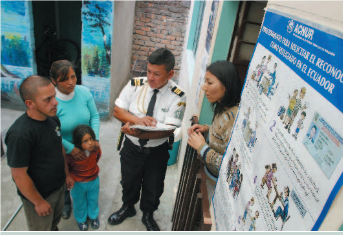
Ecuador: Colombians can apply for asylum and receive legal advice as well as information on their asylum cases at the UNHCR office in Ibarra.

projects, health and education assistance and 17 CISPs, including three community credit schemes which benefited some 3,500 persons. Income-generating projects were accorded special importance, with a view to decreased humanitarian assistance for refugees in future. By the end of the year, the micro-credit scheme, started in early 2004, had over 160 members and 65 credits had been approved mainly for small-scale agricultural projects. UNHCR conducted workshops for members of the Eligibility Commission and police and migration officers. Over 290 primary school pupils in the Darién and Kuna Yala province received uniforms and shoes, and 20 secondary school students obtained scholarships.